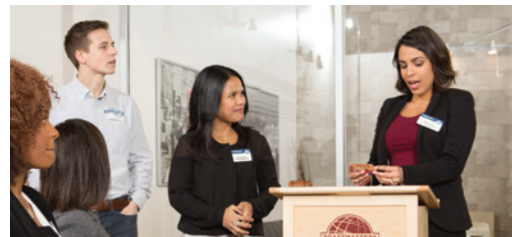
Table Topics. During Table Topics, all attendees have an opportunity to present one- to two-minute impromptu talks. This is often the most challenging and fun part of your meeting.

The order and length of these segments may differ from club to club. The length of a club meeting often determines the amount of time for each segment.